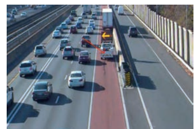
Highway patrol on site to clear incident