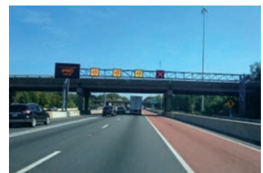
Shoulder closed to traffic (red cross dynamic sign)