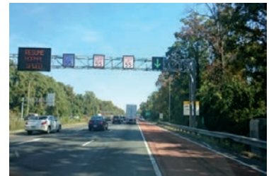
Shoulder open to traffic (green arrow dynamic sign)