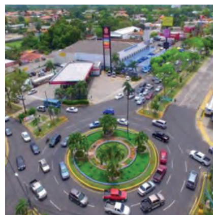
Heavy traffic in San Pedro Sula