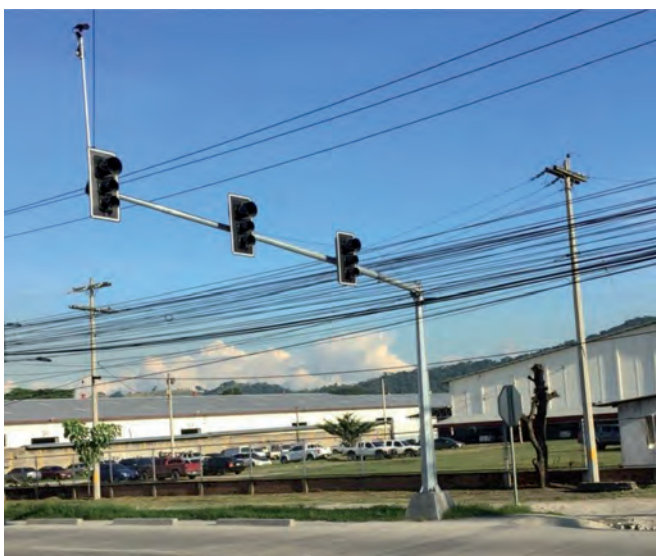
XCam installed on a pole mounted on the traffic light